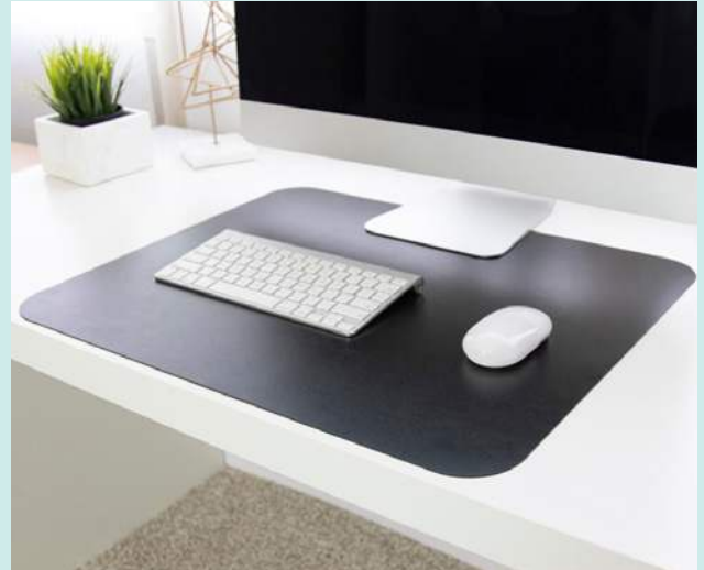
WORKS GREAT AS A MOUSEPAD