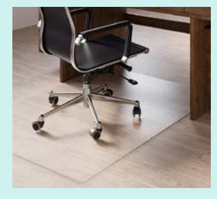
OR CARPET Choose from a variety of sizes and applications.