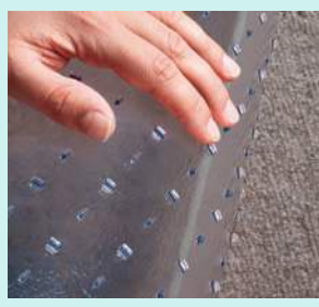
FEATURES ANCHORBAR® AnchorBar® carpet cleat system holds securely, yet is gentle on carpet and hands