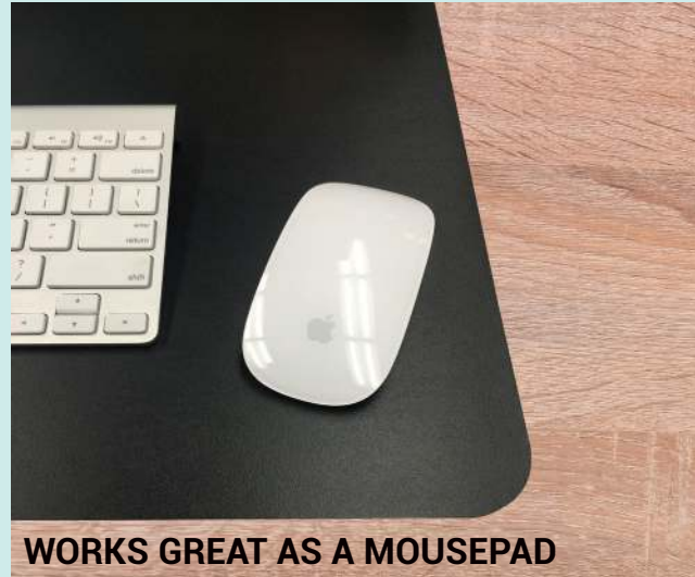
WORKS GREAT AS A MOUSEPAD

ES ROBBINS Natural Origins® desk pads are the first to replace traditional petroleum and fossil-fuel based phthalates with Gen7V®, a plant-based Biopolymer. Desk pads protect desks from scratches and stains as well as create a smooth surface, reducing writing fatigue. Our elegant black desk pads provide a professional look and create an ideal accent for any desk.